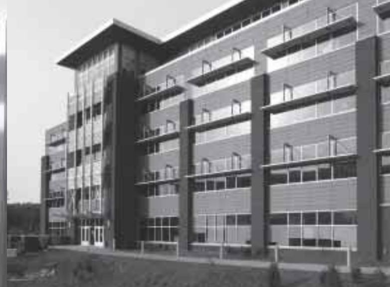
The N.C. Wildlife Resources Commission Building located on Centennial Campus.

the wall that admits daylight. This arrangement allows the glazing in the day-lighting wall to be located high in the wall, assuring good penetration of the light into the interior space.