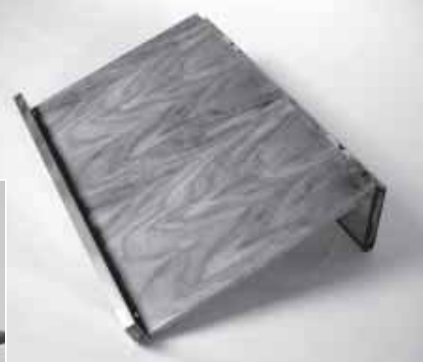
Above: Chancellor Oblinger’s walnut lectern.