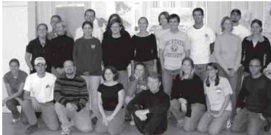
Crossnore charrette design team