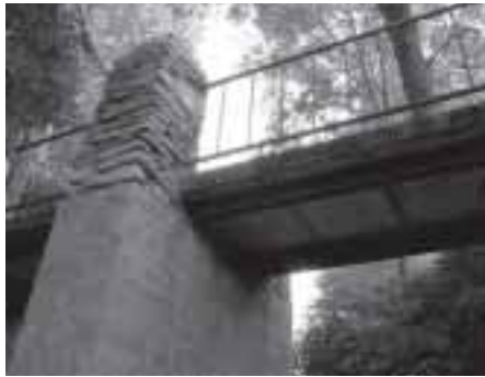
Crossnore’s bridges were identified as a visual amenity by the students.

Milburn notes other benefits of the charrette structure. “It is very important for students to learn that the best design solutions sometimes come from the client, if they learn how to actively listen. After all, they know the site best! Sometimes we just have to show them how to look at their resources in a different way.