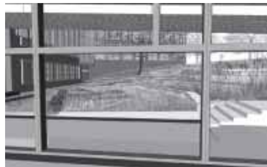
Sidwell Friends Middle School, Washington, D.C., View of Constructed Wetlands, Andropogon Associates, Ltd.