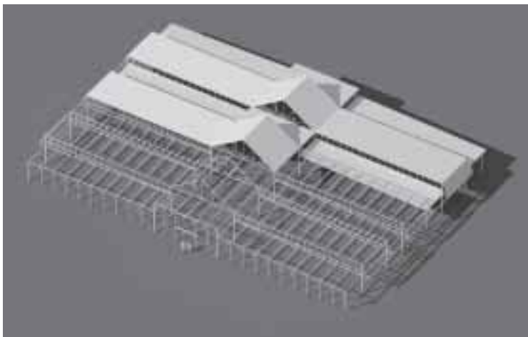
An example of a structural system explored in the book.