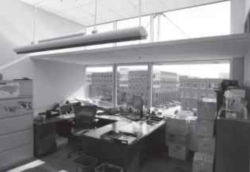
Perimeter office of the N.C. Wildlife Resources Commission Headquarters building.